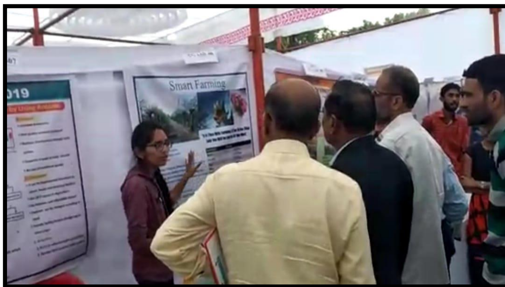
Students Participated in Poster presentation [Smart Farming 'Wonder crop dragon fruit] Competition